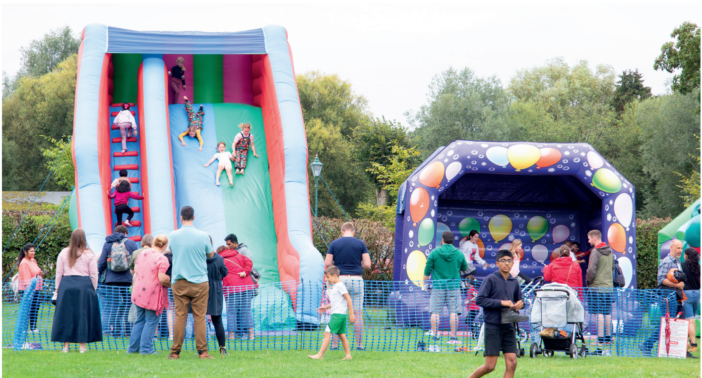
▲ At our Family Fun Day we welcomed over 500 staff with their family and friends for some traditional fun, entertainment, activities and treats