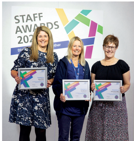
▲ Staff receiving their Long Service Awards

Once again the Trust thanked staff and their families with three days of events in the Cathedral Close. With generous support from the Stars Appeal and League of Friends over 2,000 people enjoyed the Family Fun Day, Comedy Night and the Annual Awards. In addition our amazing volunteers were thanked with a special lunch and the long service of staff recognised with a ceremony celebrating their 25 years service.