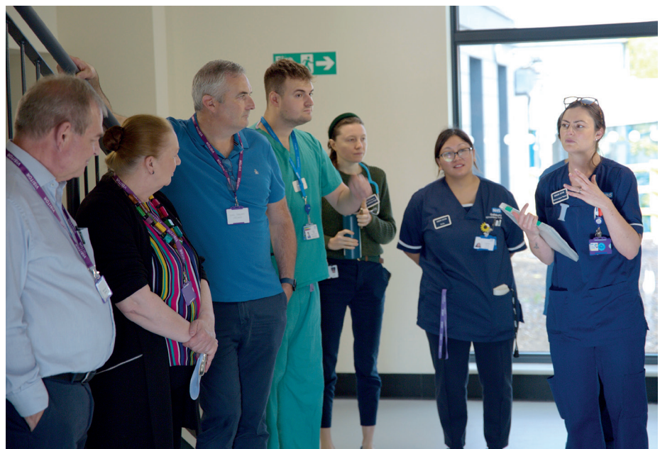
▲ Staff during a regular Huddle meeting