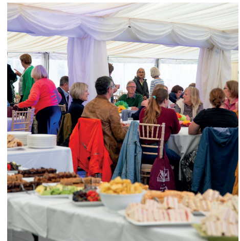
▲ Volunteers enjoying their thank you lunch