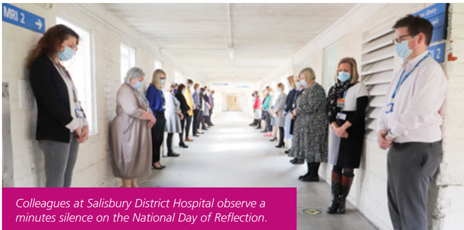
Colleagues at Salisbury District Hospital observe a minutes silence on the National Day of Reflection.

Governors play an important role in the management of Salisbury Foundation Trust representing the views of the membership. I would like to thank all those Governors who are ending their term for everything they have done and good luck in the future. The enthusiasm, commitment and thoughtful contributions from Governors supports the Board, the Senior Leadership and staff on a daily basis and this engagement contributes to the improvement of patient care and our ability to respond to the needs of the community we serve. If interested in being a Governor, please look out for future opportunities.