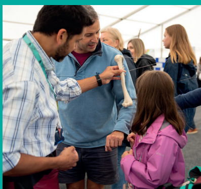
▲ Part of the Tents Talks in the Open Day marquees

Making use of the marquees erected for the Open Day staff at the hospital were offered 2 days of learning and wellbeing at the hospitals first ever Tent Talks. There were over 30 events and speakers that included inspirational speakers from the military, talks on inclusion, wellbeing sessions on sleep and aromatherapy and a comedy night for friends, family and colleagues from partner organisations.