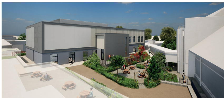
▲ Artists impression of the new Imber Ward

We have also recently refurbished Whiteparish Ward, relocated our Central Booking team to the refurbished Douglas Arter Centre and invested in making the hospital more sustainable. This coming Spring the survey to establish the viability of using geothermal heat will be completed.